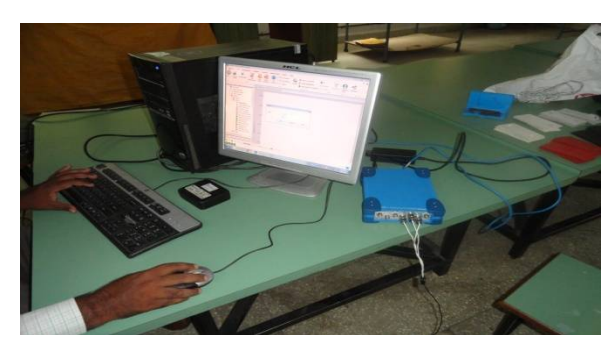
(b) Figure a: Experimental SetupFigureb: Experimental Setup Instrumentation

Experimental setup consists of electric motor (0.37 kW), shaft (material stainless steel of \Phi 15 mm diameter of full length 630), two bearings, two discs, bearing's base plate, bearing's support plate, base plate and jaw coupling. The major part of this test setup is base plate which is made up from C – Channel having dimensions 200x100x25mm. The base plate also facilitated with number of holes to change the bearing support positions according to the requirement at various locations. The main objective of bearings support plate is to give rigid and firm support to the bearings of the test setup. The dimensions of plate are 200 mm x 100 mm x 33 mm.